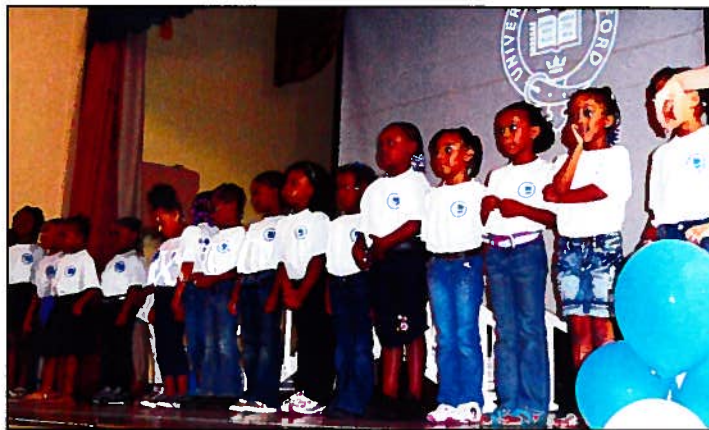
Oxford graduating class of 2010 (Kindergarten)