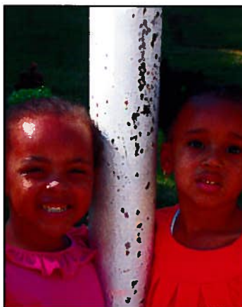
Students ready for fun, food, music, and family at the Carnival

Following the Bridge Ceremony on June 18th, families joined Excel in an ongoing tradition, a family carnival. Face painting, two moon bounces, live kids music, and delicious BBQ kept scholars and parents entertained and happy. It was a beautiful sunny day filled with joy and anticipation for the new school year to come.