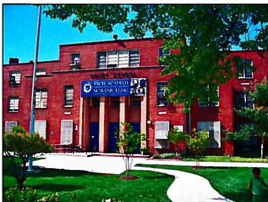
Excel's New School Building!

2010 school year, Excel increased our enrollment by 56% in order to meet growing demands from the community. Excel's administration knew that 210 students could not fit in the educational annex at our original location, so we looked for a new location that could hold us for the years to come. With the help of Building Hope, a non-profit that helps charter schools find and lease school space, we moved into the old Birney Elementary School building. We had a new location, space for returning and new students, and returning and new teachers. Our second year was even better than the first. To