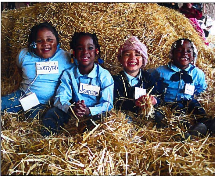
Hay! PS & PK scholars at Butler's Orchard

Kindergarten through 2nd grade students visited Cox Farms in Centerville, VA at the end of October. Scholars had been learning about non-living and living things, different communities (rural, suburban, urban), and life cycles. The field trip to Cox Farm reinforced the lessons scholars were learning in class and was also a whole heap of fun. Cox Farms Fall Festival includes fun activities like hayrides, giant slides, farm animals and their babies, a cornfield maze, straw tunnels, pumpkin picking, and hot apple cider.