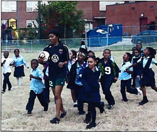
Scholars head out to the field with their DC United soccer coach

Excel provides learning and fun during regular school hours AND through our various after school activities. Excel students can participate in the Girls Scouts of America (Wednesdays & Fridays), Dance (Tuesdays & Thursdays), and soccer with DC United (Mondays). Students enrolled in Excel's After School program have been busy making scarecrows, candy apples, and decorating pumpkins.