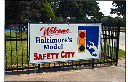
PS & PK students learn to be safe while navigating miniature city streets

Preschool and Pre-K scholars took their first field trip of the year to Safety City in Baltimore, MD. Safety City is a miniature version of Baltimore used to teach children about traffic safety in a realistic, fun and safe setting. The scholars had a great time learning about ways to cross the street, identifying different environmental print (recognizing a traffic sign before you can read), and learning new songs/chants on ways to be safe. The scholars spent an hour at Safety City and had an opportunity to play at one of the "best" playgrounds in Baltimore located in Druid Hill Park.