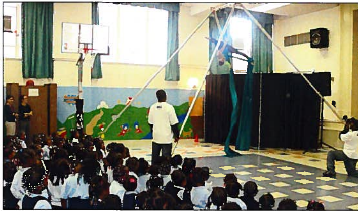
Bounce Around acrobat shows scholars what is possible when you're fit.