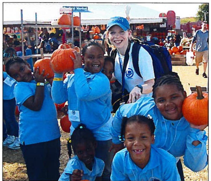
K - 2nd scholars at Cox Farm

Preschool and Pre-k scholars visited Butler's Orchard in Germantown, MD. Scholars spent the day picking pumpkins and playing in the hay. Bulter's Orchard offered our scholars a chance to see the country-side, play in the dirt and hay, and expand their understanding of the natural environment. Their activities reinforced the lessons the scholars had in fall and the four seasons, pumpkins, apples, and things that grow.